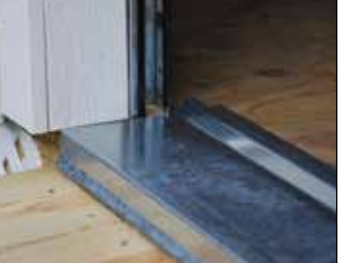
Trac-Rite's zinc-coated sill plate provides protection against sill damage and water intrusion.